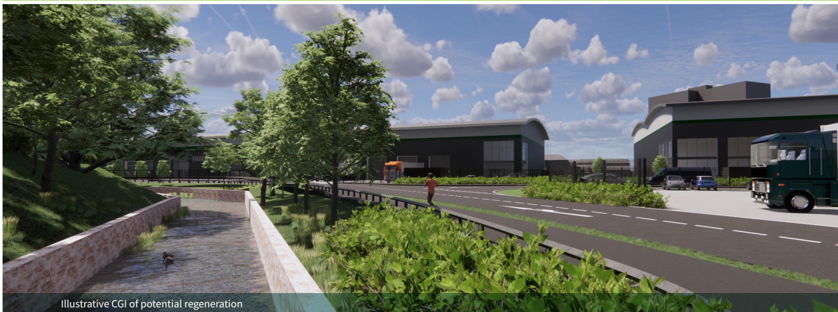
Illustrative CGI of potential regeneration

PUBLIC CONSULTATION: 21 FEBRUARY – 14 MARCH 2022